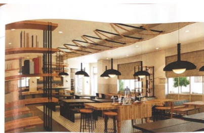
FROM TOP TO BOTTOM: Delta Meat Market will move its popular eatery to the Cotton House Hotel. Guests will appreciate the casual, yet elegant, styling of the guest rooms. At Bar Fontaine, delectable small plates like Shrimp Carpaccio will be offered. OPPOSITE, CLOCKWISE FROM TOP LEFT: The rooftop patio at Bar Fontaine will provide guests a spot to visit, enjoy a meal, and watch downtown happenings. Additional dishes include the Polenta and Polpetta Alla Bologna.