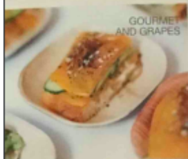
GOURMET AND GRAPES